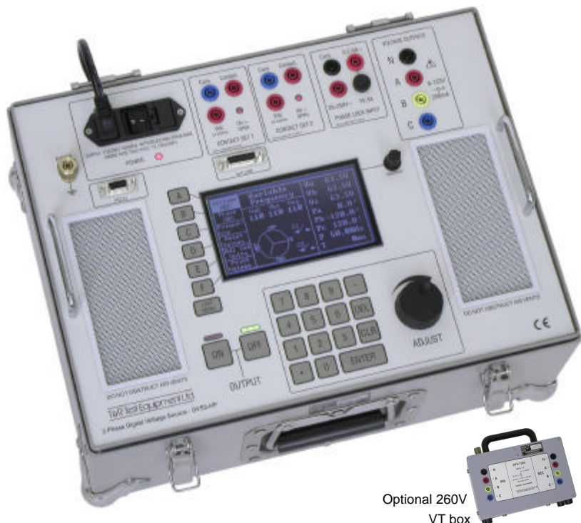
Optional 260V VT box