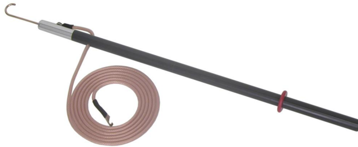
ES30 Earthing stick

If you require a different output voltage test system, please contact us with your specification and we will quote for a custom design.