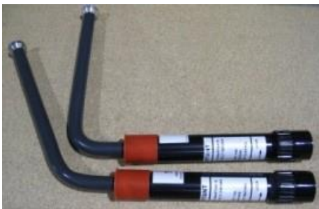
Bent End Adaptors