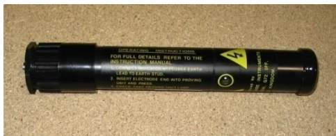
HVI Proving Unit

Range: 0.2 to 15kV 50/60HZ and DC Circuit Current: 0.4mA nominal at 15kV 0.293mA nominal at 11kV Dielectric Test: 20kV for 1 minute Length: 485mm Diameter: 32mm Weight: 0.6kg