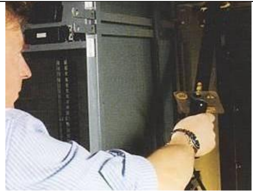
HVI - Switchgear Testing